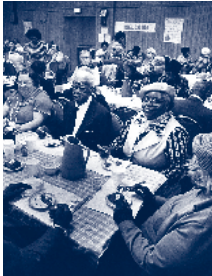
Members of Community Renewal Society's Senior Ministries Network at a monthly lunch gathering.

I n the wake of the funding crunch following 9/11, Community Renewal Society consolidated its programs and redesigned the Senior Ministries Network, focused in part on a collaborative relationship with the Chicago Department on Aging, the Chicago Department of Health and Advocate Health Care. The year 2003–04 saw some major accomplishments chalked up by this newly restructured organization.