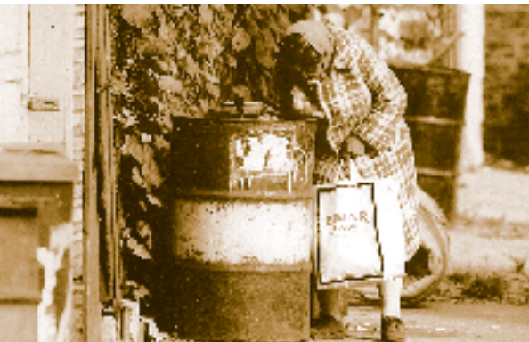
The Senior Ministries Network works with seniors in combating issues that most affect that population like healthcare, security and poverty.